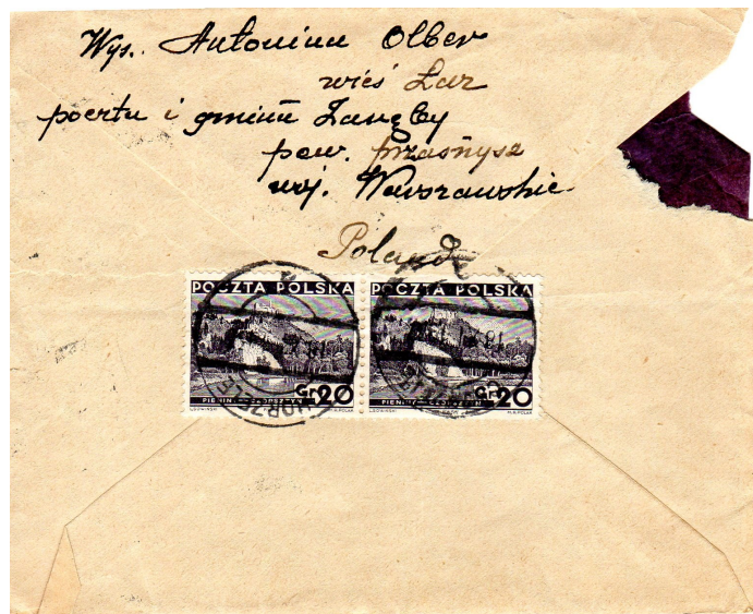
Back of letter envelope to the author's grandfather showing the originator and additional international postage.

I found the above envelope among my father's things just recently. It is probably not a significant philatelic item, but it is of personal significance to myself. It contained a letter to my paternal grandfather from his wife's brother—an envelope that escaped the cut and soak by my father, who was 18 at the time and probably not actively collecting.