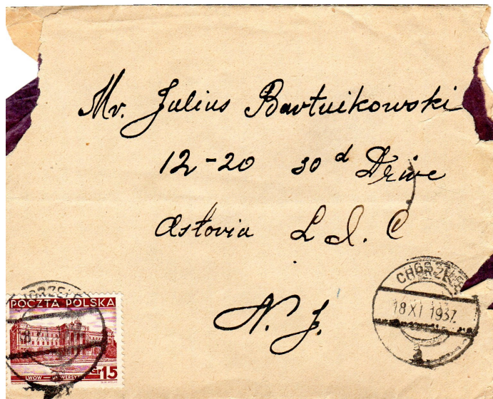
Front of letter envelope to the author's grandfather from Chorzele, Poland on November 18, 1937