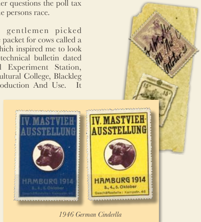
1946 German Cinderella

If you would like to share your collection consider giving a short 10 min lecture at one of our meetings or bring an interesting item you would like to show the group. Meetings are the 2nd and 4th Wed on the month at the Edgmere Retirement Center.