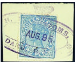
1899- 1905 'TAMATA/BNG' cds