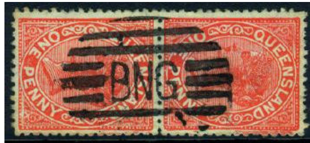
1899- 1902 'REGISTERED/NIVANI BNG' h/s

The above pictured pair features an anomaly of BNG postal history, which is in keeping with the relatively unknown numbers of philatelic usages ( or 'cto/per favour'), of the rarer cancellations. This particular 9-bar obliterator of Samarai shows damage on the 'B', which occurred sometime after the BNG stamps were issued, and Queensland stamps were no longer in valid circulation. Cancels with the damaged 'B' are hence not true postal examples. However, the 9 bar cancel is relatively common on Queensland issues, although this is not the case with the majority of the Postmarks, which are, in some cases, extremely rare, and only exist as 'per favour'.