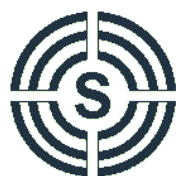
W.H. Smith & Sons